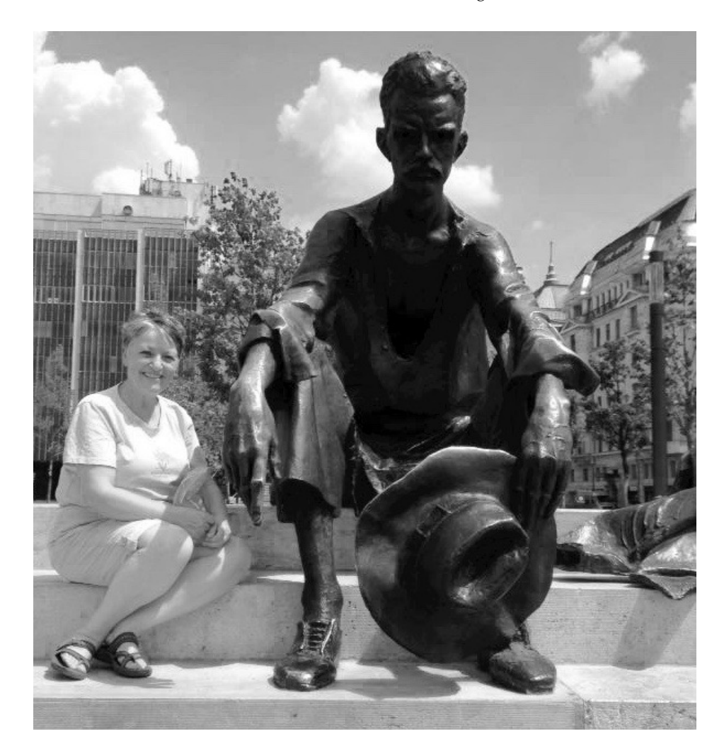
Hungary, short-term, in order to lead the way for the rest of our FBE members. Like

There is so much we would all love to share with you about this incredible experience that time and space do not allow. But I can tell you that only God could have put together a group with such varying talents. Our group was from all over the state of NC, and each of us had different gifts to share.