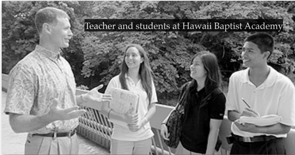
Teacher and students at Hawaii Baptist Academy