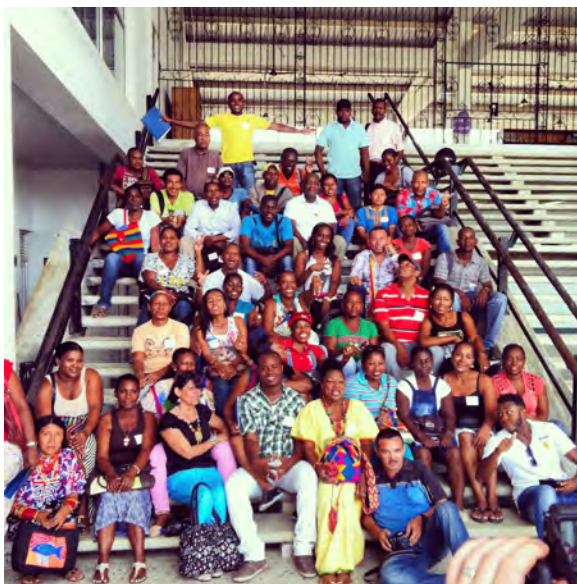
Teachers on our last day of class in February

that every person graduating from high school and university have a high level of English competency. However, resources to make that happen in the rural and indigenous areas are few.