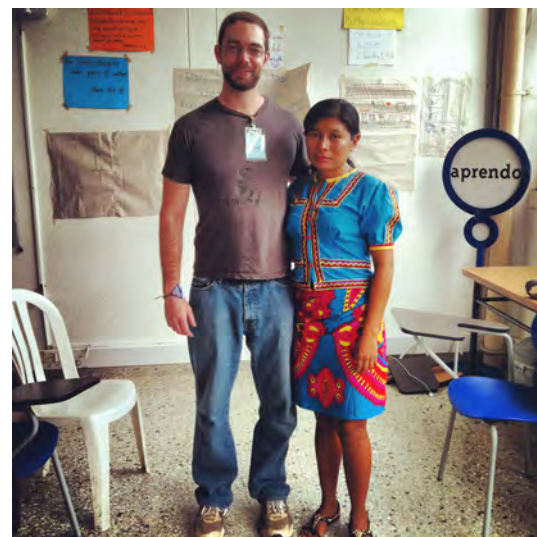
One of the indigenous teachers and one of our team members